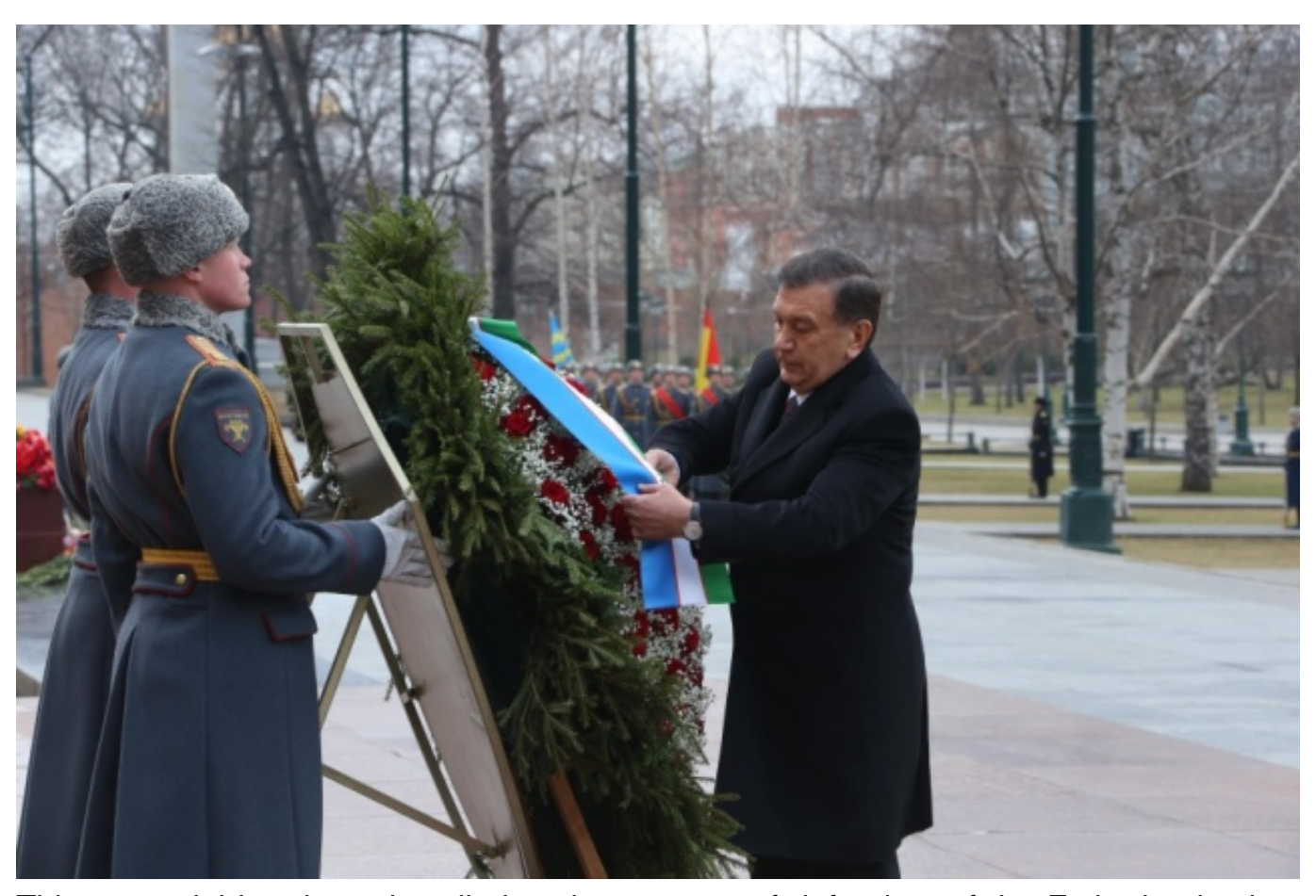
This memorial has been installed to the memory of defenders of the Fatherland, who had died during the Second World War.

Shavkat Mirziyoyev paid a tribute of respect to the memory of devoted patriots, who had sacrificed their lives for peace and freedom.