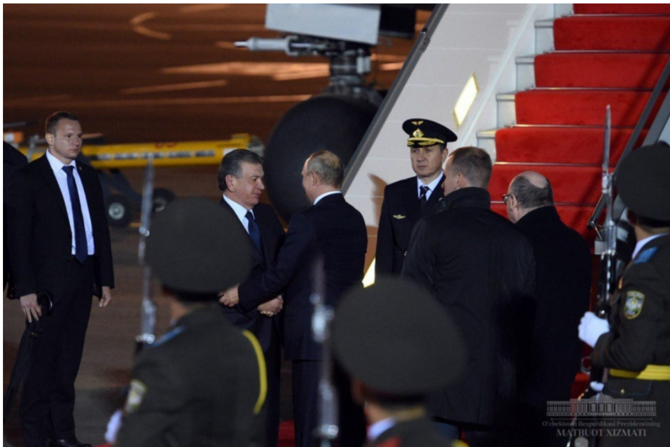
President Vladimir Putin departed for Russia. President Shavkat Mirziyoyev has seen off the President of the Russian Federation.